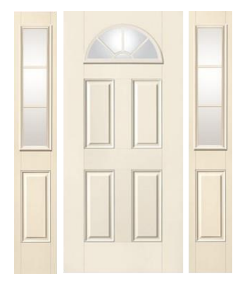
Door Style # S255 Sidelights Style # S263SL