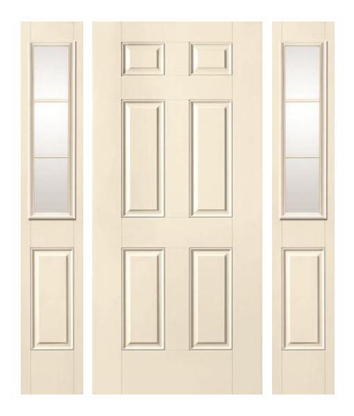
Door Style # S210 Sidelights Style # S263SL