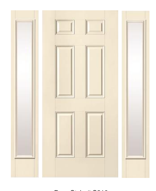
Door Style # S210 Sidelights Style # S100SL