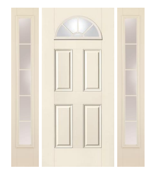
Door Style # S255 Sidelights Style # S308SL