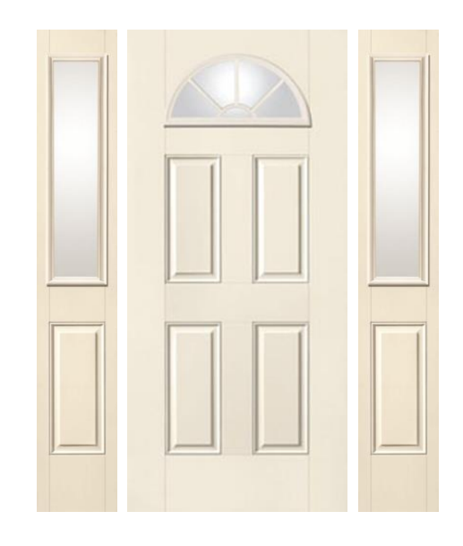
Door Style # S255 Sidelights Style # S210SL