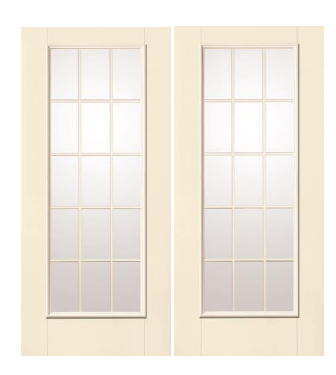
Door Style # S108

Heister House Millworks Inc. I 1937 Troup Valley Road I Mt Pleasant Mills, PA 17853 Ph. 800-326-9873