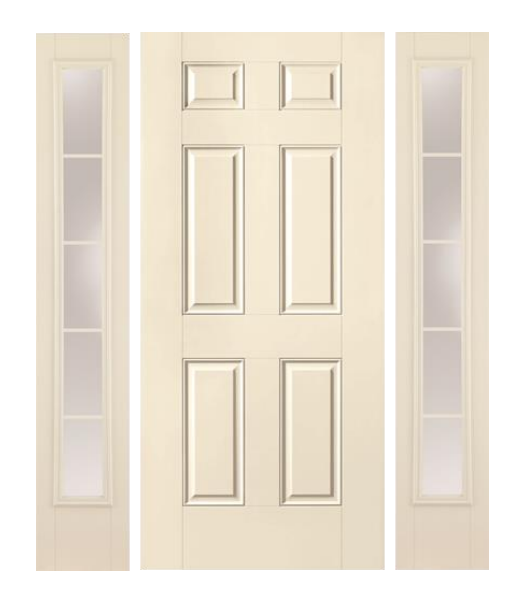
Door Style # S210 Sidelights Style # S308SL